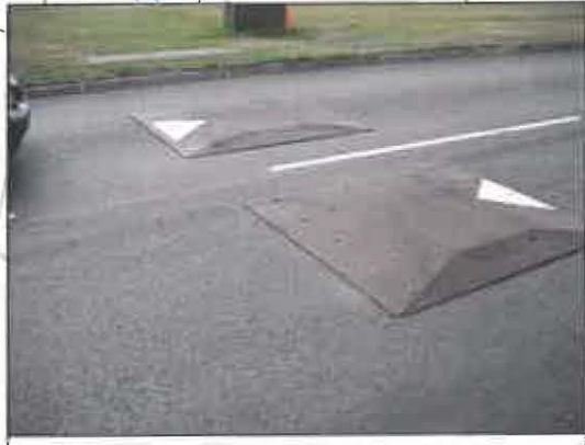
EXAMPLE OF SPEED CUSHIONS

COUNTY HALL * GLENFIELD * LEICESTER * LE3 8RJ Tel No : 0116 3050001 www.leicestershire.gov.uk